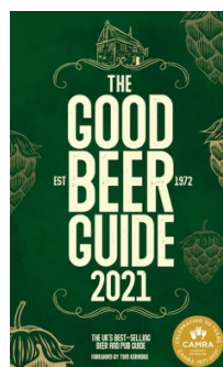
Good Beer Guide