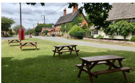
Benches on the Knoll